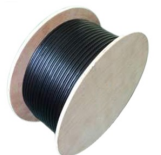
1000' Wood Reel Weight: 41 lbs.